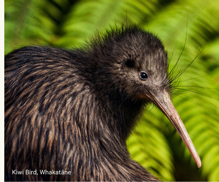
Kiwi Bird, Whakatāne

For more info, visit: westernbay.govt.nz