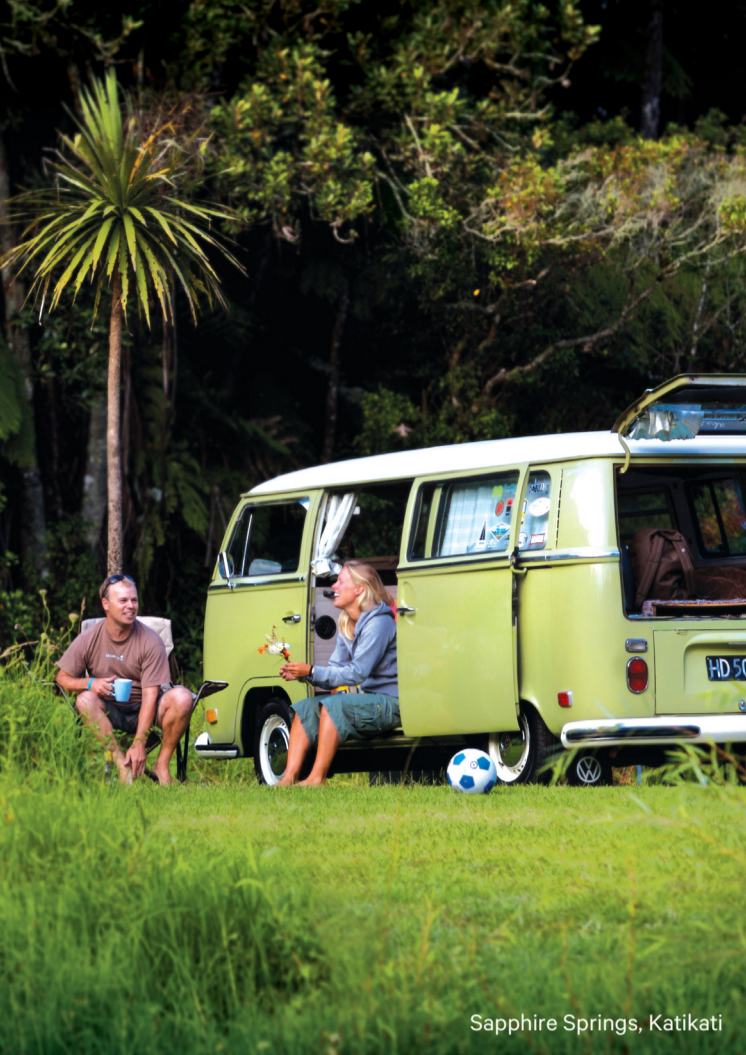
Sapphire Springs, Katikati