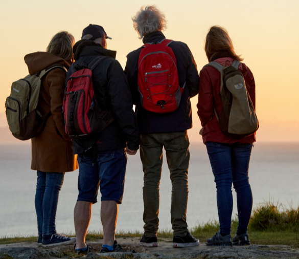
Bowentown, Waihi Beach

NĀU MAI, HAERE MAI KI TE MOANANUI Ā TOI!