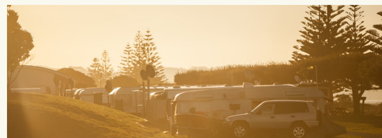
Ōhope Beach Top 10 Holiday Park