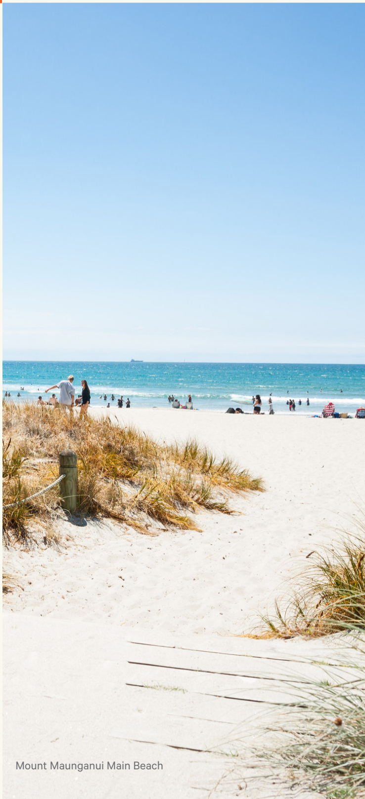
Mount Maunganui Main Beach

tauranga.govt.nz/exploring/travel/freedom-camping